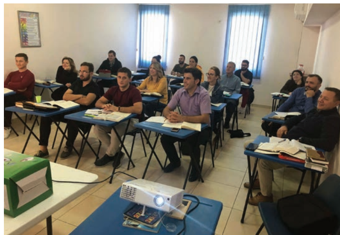
Above (L-R): The 2018 graduates of IBEI's extension school in Shkodër, Albania, are ready for a lifetime of ministry; These 2019 students minister in their home churches while also studying.